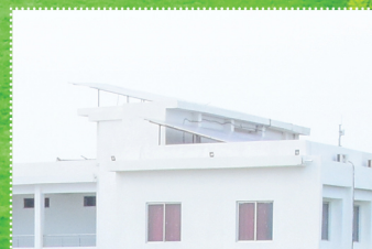
Solar Power Plant