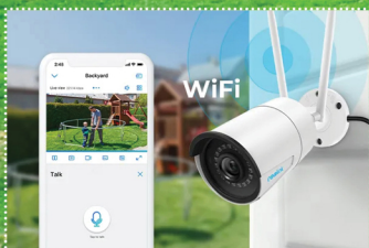
Wi-Fi Campus with 24x7 | CCTV Surveillance