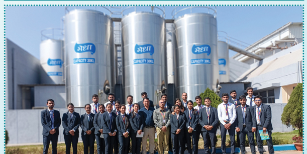
Plant Visit to Medha Dairy