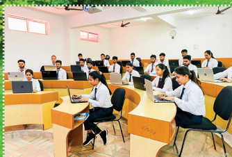
Theatre Style Classrooms