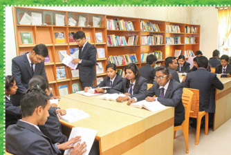
Well stocked Library