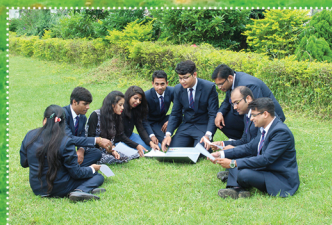
Lush Green Campus