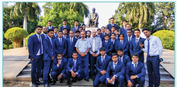
Visit to Tata Motors Plant