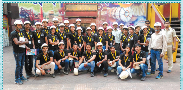
Visit to SAIL Bokaro Plant, Bokaro