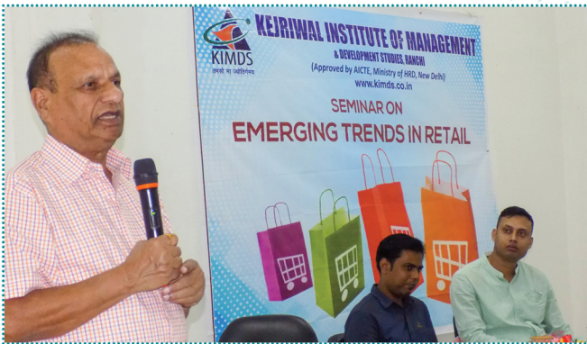
Seminar and workshops

Guest lecture by key people from corporates